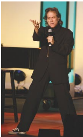
Comedian Richard Lewis made the audience laugh with his unique view of the world

The IMF is grateful to all of our sponsors, led by Presenting Sponsor Celgene, for helping to provide the support to make this event so successful. Please see the complete list of all our sponsors.