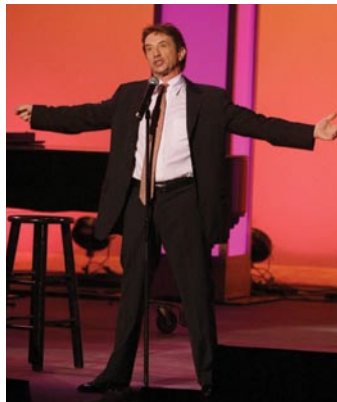
Renowned actor and comedian Martin Short brought the house down with his hysterical song "Autumn Makes Me Want to Cheat on My Wife."