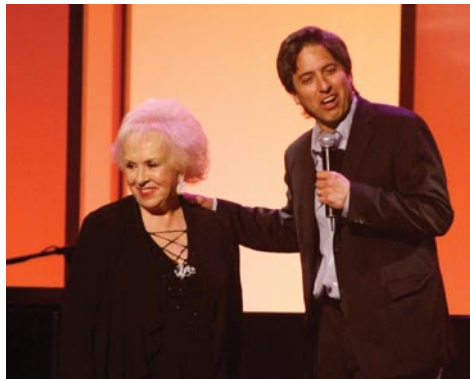
Doris Roberts reminisced about Peter Boyle and then shared a moment on stage with Ray Romano

A huge applause followed the film and Ray Romano, host of the show took the stage; the audience spent the next hour and a half in raucous laughter. Jeff Garland and Richard Lewis also performed outrageous, bawdy, and hysterically funny comedy routines. Fred Willard performed a