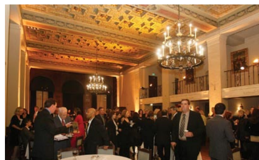
Guests enjoy champagne and dessert at the post-show VIP reception at the historic Wilshire Ebell