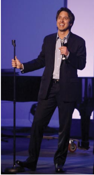
Actor Ray Romano hosted the show, keeping the audience laughing between the acts and sharing poignant memories of Peter Boyle from their years together on Everybody Loves Raymond