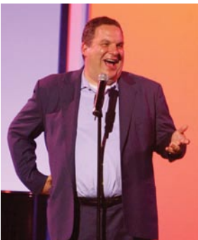
Actor and comedian Jeff Garlin cracked up the audience with his humorous take on everyday life