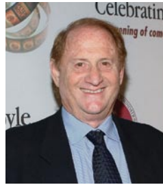
Mike Medavoy, President and CEO of Phoenix Pictures, served as honorary co-chair for the event and provided the opening remarks for the show