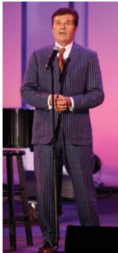
Fred Willard performed a campy musical number "Artificial Flowers."